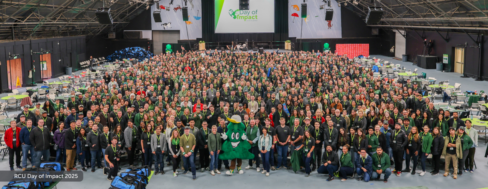
RCU Day of Impact 2025